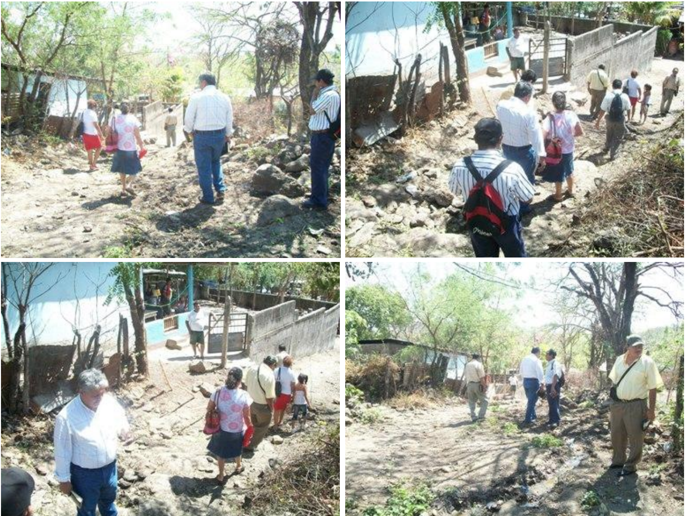
Group of brothers walking along the street of the Banderas to preach the gospel to the persons of there.