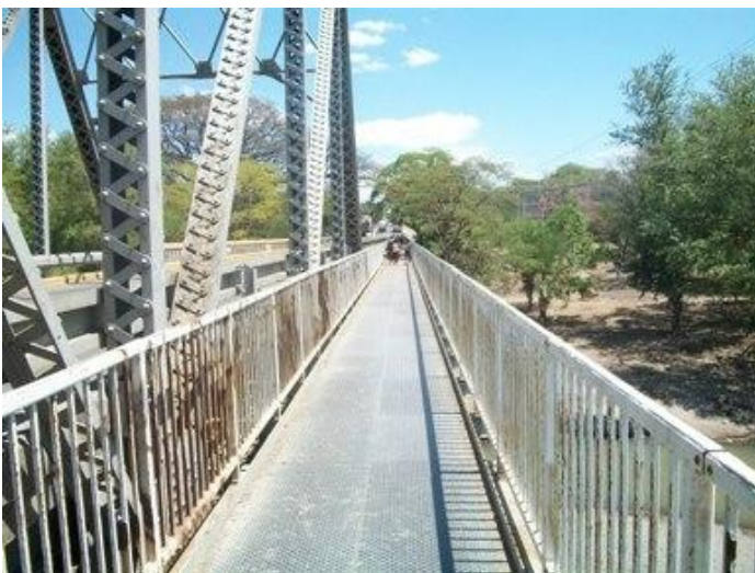
Bridge of the river of the Banderas, very dangerous river in winter time. Old house of the Banderas