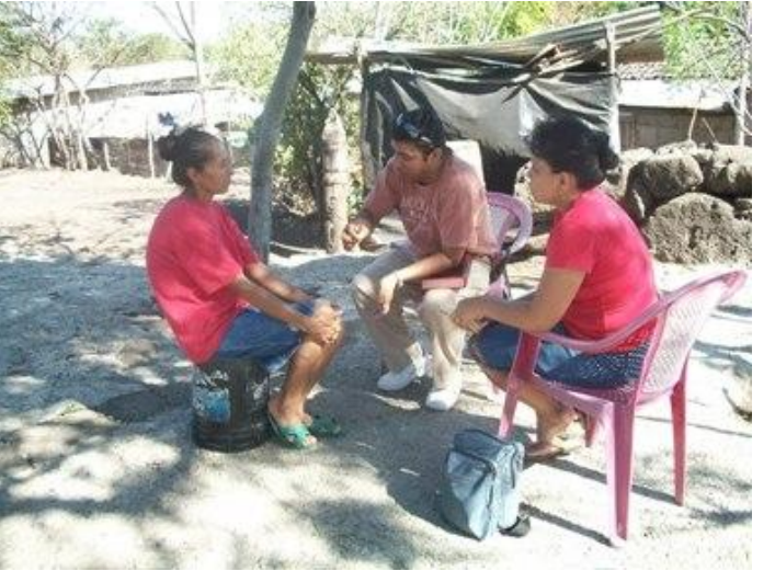
Preaching in the way in the houses of the persons, the intention is of preaching all the persons in all the places