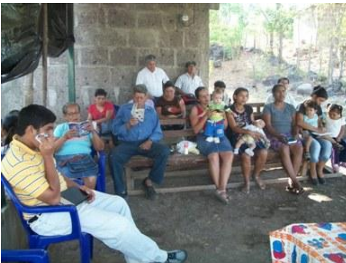
Brothers of the Banderas.